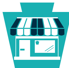
Existing Business Owner

These symbols are used to denote which sections are more useful for new entrepreneurs and which ones contain information geared toward existing business owners. Sections not designated by either icon contain information that is relevant for both types of entrepreneurs.